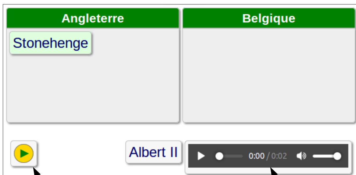
HTML5 mini audio button

There is two kinds of HTML5 audio player :